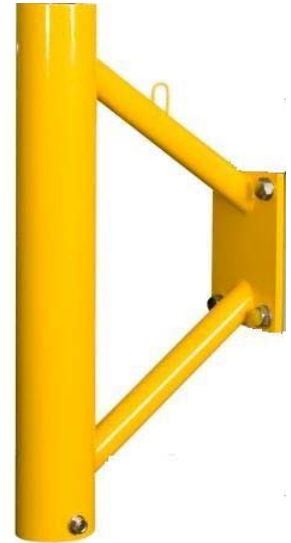
Logger holder to take the data logger