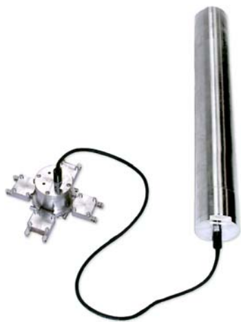
INTEGRIPod™ SM HS+ high speed logger – Logger module and sensor module