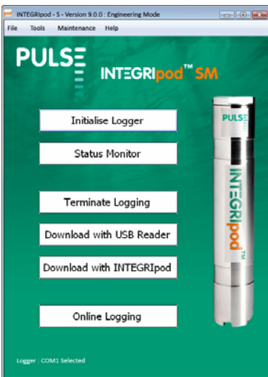
Software to initialise the data logger