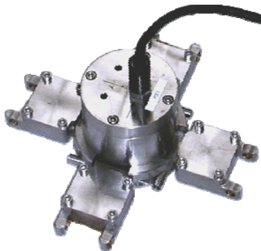
Sensor module allows easy installation by ROVs or divers

The INTEGRIPod™ SM HS+ is a stand-alone motion data logger designed for high speed data logger in harsh deepwater environment. The maximum sampling frequency for acceleration measurement is 4 kHz. It records the measured acceleration into its on-board memory and the acceleration data is downloaded into a computer for subsequent data processing after the logging campaign.