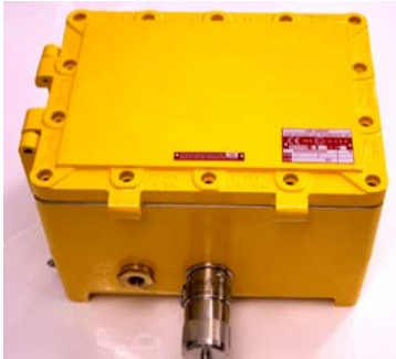
Upper flex joint riser inclinometer contained in an EExd housing

The measurement data is displayed and compared with preset thresholds. Where measurements exceed predefined threshold, alarms are raised by the software.