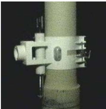
ROV deployable holder for INTEGRipod™

The angle data is sent to the topside data acquisition system via an acoustic receiver