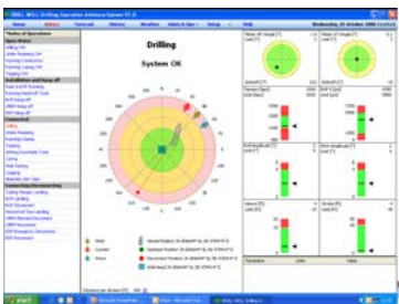
DRILLASSURE™ software screenshot